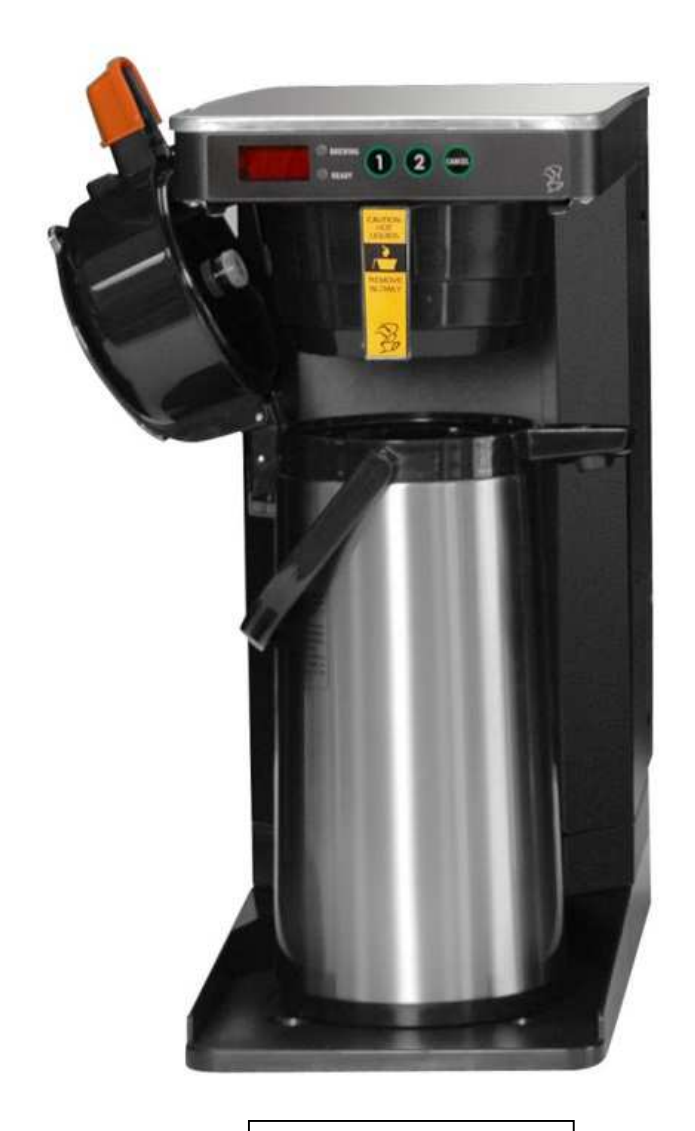
Model 20:1-AP Airpot not Included